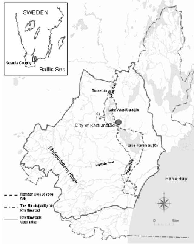
Figure 1. The lower Helgå River catchment with the Ramsar Convention Site, Kristianstads Vattenrike, and the Municipality of Kristianstad. (Olsson et al 2003)